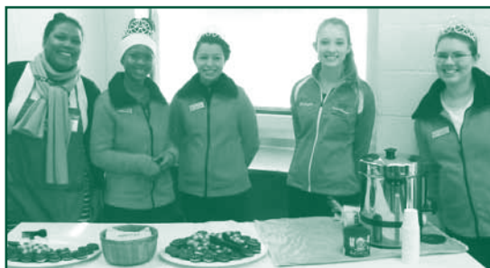
NE Royalty serving treats to the President's Day participants