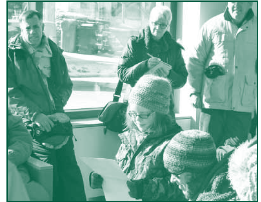
A NE Urban 4H member reads facts about one of the presidents at Northeast Library