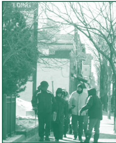
Walkers head down Central Ave to the next warm up location

If you would like further information about the walk, call Northeast Community Education at 612-668-1515.