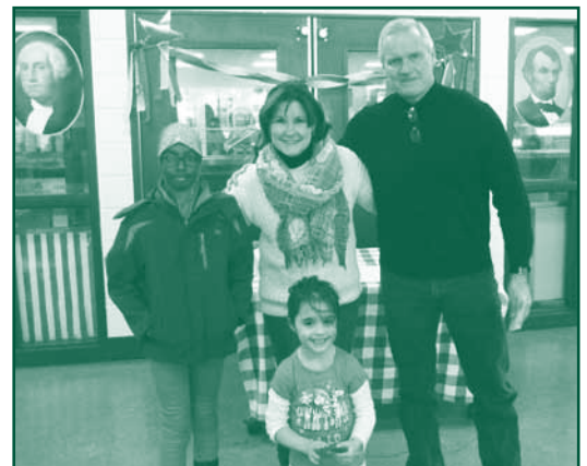
Winners of the Coloring Contest sponsored by Northeast Bank