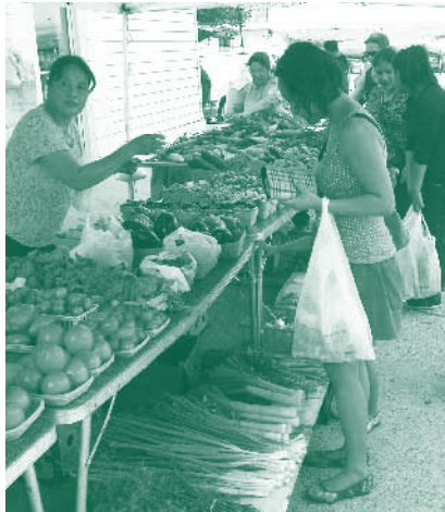
Shopping the Audubon Mini Farmers' Market

On Thursday, June 25, Gustavus Adolphus Lutheran Church will host their annual start of summer carnival across the street, on the church lawn, during Market hours.