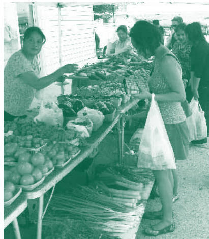
Shopping the Audubon Mini Farmers' Market

On Thursday, June 25, Gustavus Adolphus Lutheran Church will host their annual start of summer carnival across the street, on the church lawn, during Market hours.