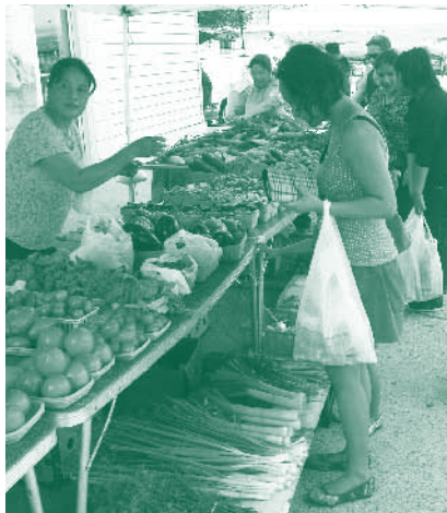
Shopping the Audubon Mini Farmers' Market

On Thursday, June 25, Gustavus Adolphus Lutheran Church will host their annual start of summer carnival across the street, on the church lawn, during Market hours.